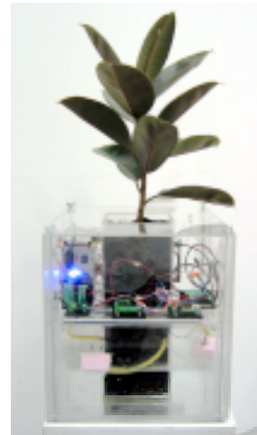
Figure 1. Spore 1.1 – case, hardware and plant.

MM'04, October 10–16, 2004, New York, New York, USA. ACM 1-58113-893-8/04/0010.